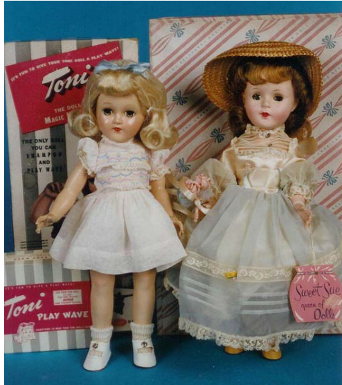
Toni and Sweet Sue Comparison